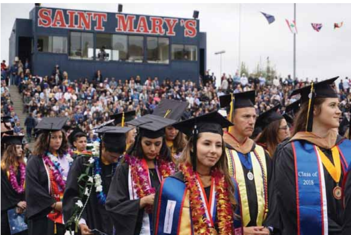
The Saint Mary's College class of 2018 waits for their turn to receive diplomas on May 26. Approximately 600 students were awarded undergraduate degrees; nearly as many completed advanced degrees at the post-graduate commencement May 27.