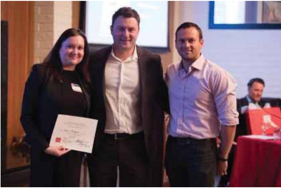
Winner of the Business Idea Competition