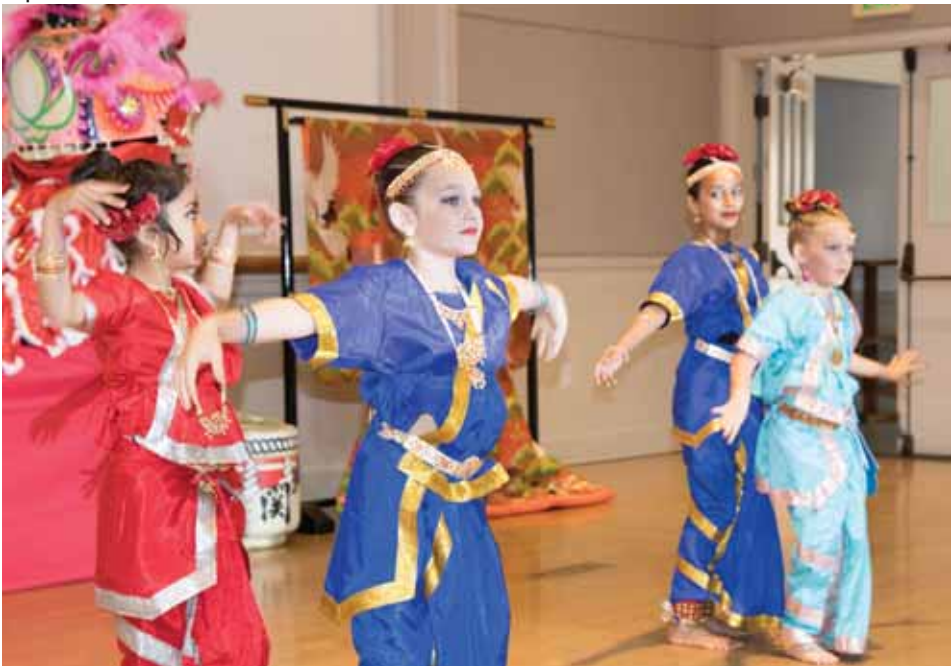
Young dancers from Hip-Hop Natyam Dance Academy, the first South Asian Dance School to serve the residents in Contra Costa County.