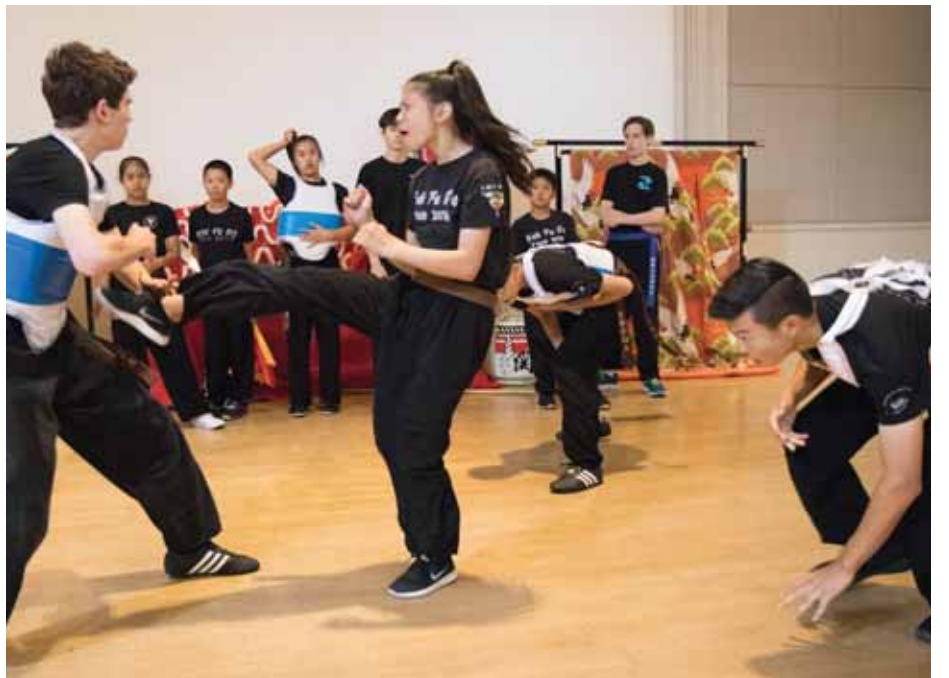
Members of the team from East West Bok Fu Do that will represent the United States at the International Bok Fu Do Association competition later this year in Baltimore, Md., demonstrate their skills.