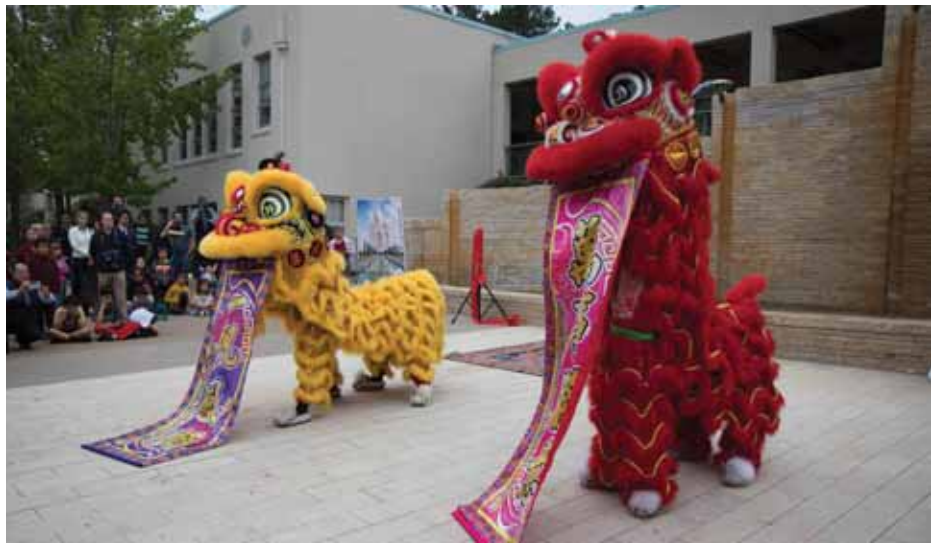
White Crane Lion Dancers unfurl scrolls of welcome at the Pan-Asian Arts Festival.